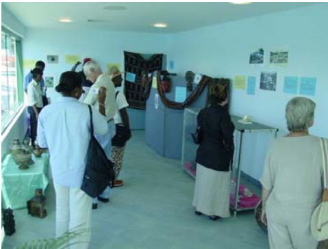
An exhibition marking the 50 th anniversary of the St Lucia National Trust. National Trusts are often responsible for archaeological work in the region.