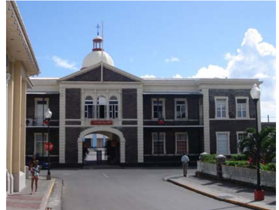
St Christopher National Museum

In addition, the Fort George Museum staff is presently occupied in designing and mounting an exhibition based on the Protective Forces on the two islands.