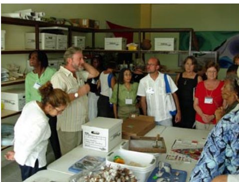
Archaeological centre in St Maarten

Archaeological work around the Caribbean has uncovered valuable items to be added to museum collections. Together, archaeologists, historians and museum professionals help uncover the diversity of heritage in the region.