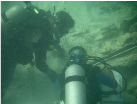
Archaeologists looking for the slave ship Trouvadore , Turks and Caicos Islands