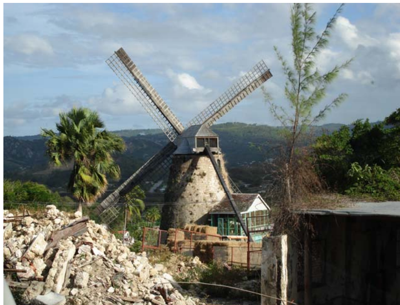
Come and explore the heritage of Barbados with MAC

MAC is an organization to help Museums and Museum professionals in the Caribbean. It relies on the membership to direct and help the elected Board who do all the work voluntarily. This is YOUR organization and the more the membership help, the more active MAC can be.