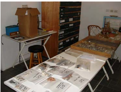
The archaeological research centre in St Eustatius