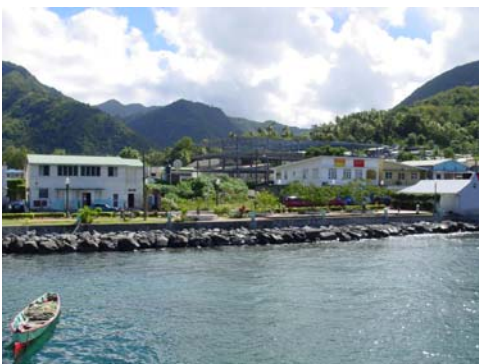
An example of unsympathetic construction work within the Pitons Management Area, 2004

The Pitons Management Area in Saint Lucia (PMA) was designated a World heritage Site by the World Heritage Committee (WHC) in June 2004. The designation was based on the area's outstanding natural beauty, spectacular geological features and highly productive biological ecosystems.