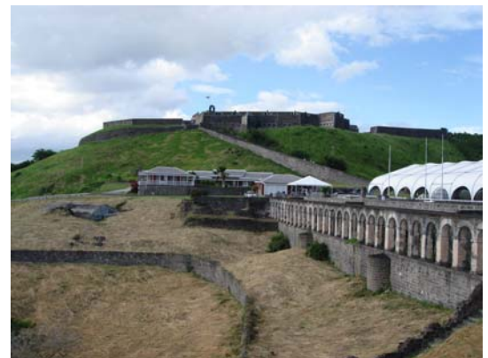
Brimstone Hill Fortress