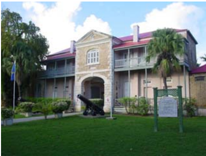
Barbados National Museum

The Barbados National Museum is located at the Garrison, and is housed in the former British Military Prison. The prison, whose upper section was built in 1817 and lower section in 1853, became the headquarters of the Barbados Museum and Historical Society in 1930.